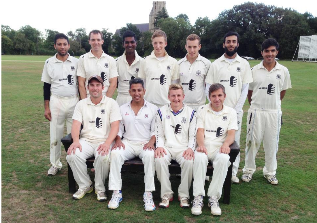
1 st XI v Harrow

Heaviest defeats: Lost by 8 wkts 1st XI v Middlesex 1987 League XI (h) Lost by 8 wkts Sunday XI v Harrow-on-the-Hill (h) Lost by 8 wkts 1 st XI v Cockfosters I (h)